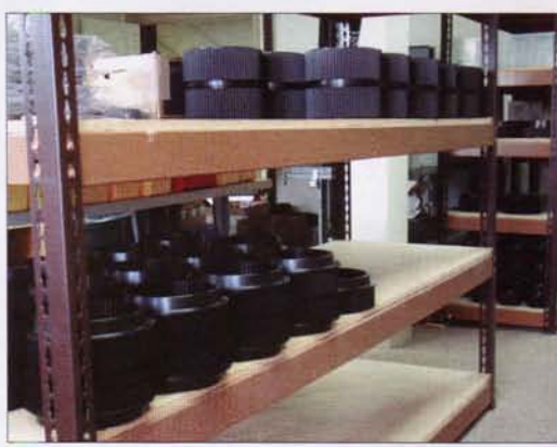
Clutch pulleys awaiting assembly into primary drives