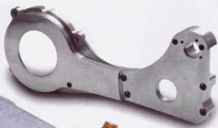
Twister Contoured one-piece motorplate from Tech Cycle is for use with four-speed transmissions