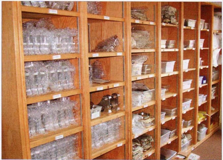
Just a small selection of motorplates available from stock at Tech Cycle