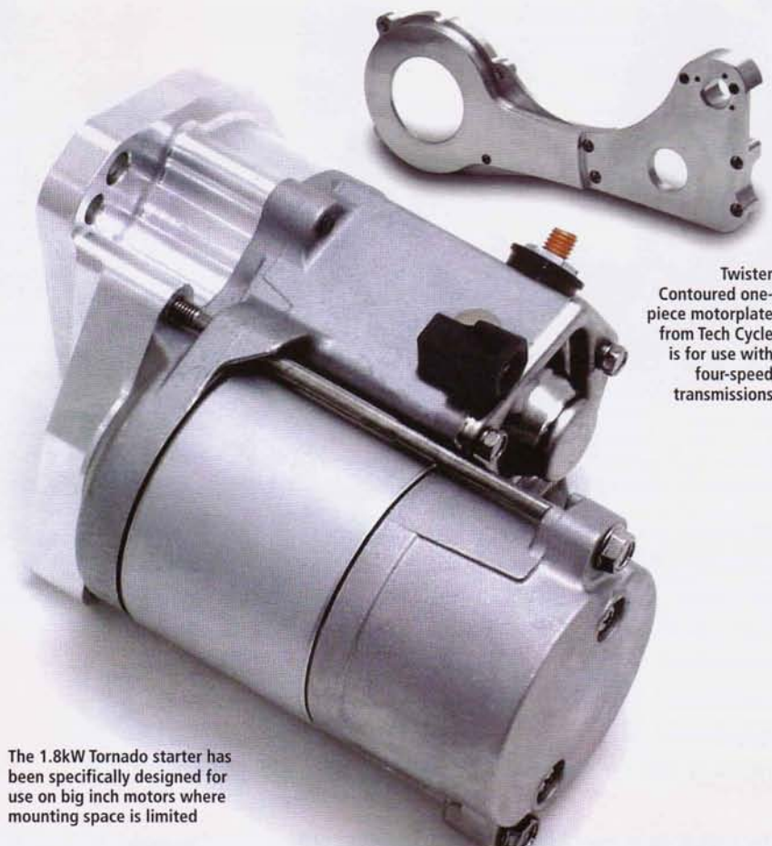
The 1.8kW Tornado starter has been specifically designed for use on big inch motors where mounting space is limited