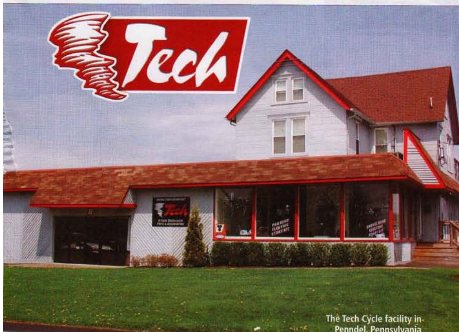
The Tech Cycle facility in Pennel, Pennsylvania