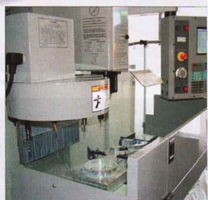
Tech Cycle is willing to undertake one-off custom work and small production runs