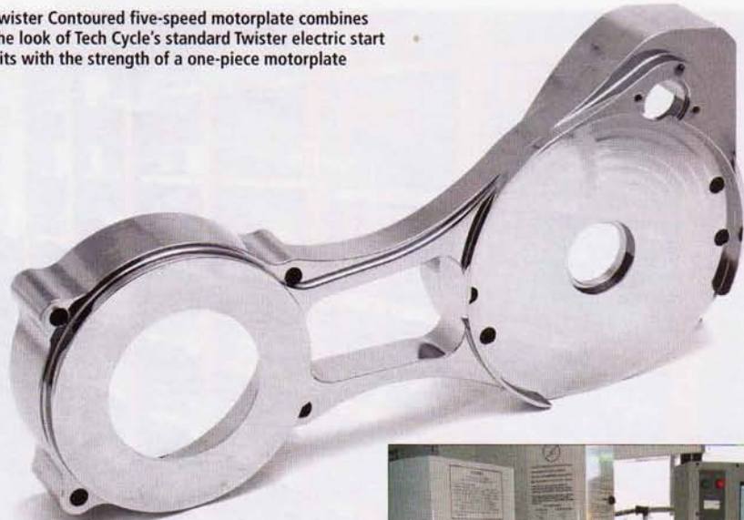
Twister Contoured five-speed motorplate combines the look of Tech Cycle's standard Twister electric start kits with the strength of a one-piece motorplate

However, the company is still at work developing new stock lines, including more OE H-D replacement