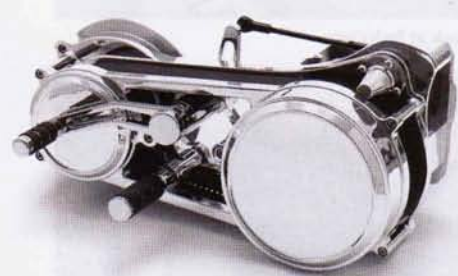
The Cyclone open primary belt drive is available with optional mid-controls