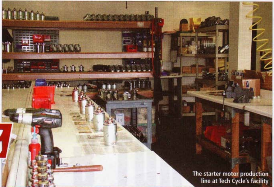
The starter motor production line at Tech Cycle's facility