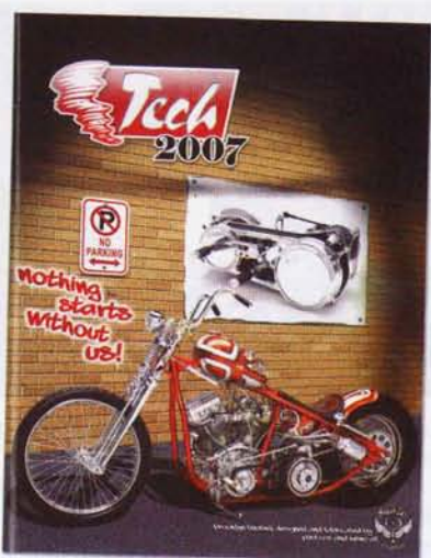
The latest Tech Cycle catalog includes details of products for 2007 H-D models

parts. "Harley seem to be regaining sales over custom builders and in response to this we are gearing up to produce direct replacement products," says Jason. He continues: "We see 2007 as a development year for FL and Bagger-specific parts. However, we already have an open belt drive system for FL models available."