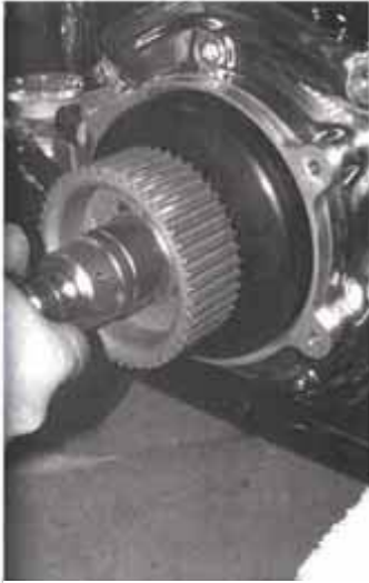
4) The Tech Cycle / BDL front pulley can then get bolted to the engine sprocket using the supplied washer and nut. A 1-5/16" socket should do the trick.