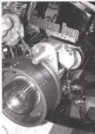
7) The Tech Cycle / BDL starter extension goes on last using the supplied hardware and a 3/16" Allen. That finishes the installation, except for the wiring.