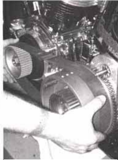
6) The Tech Cycle / BDL belt can then get slipped over the pulley and clutch basket.

Note: This is a reverse-thread nut, so don't go the wrong way!