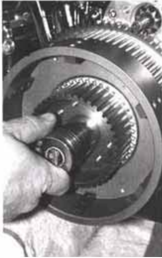
5) After positioning a key into the slot on the tranny's mainshaft, the Tech Cycle / BDL clutch basket (shell) goes on next using a 1-1/4" socket.

Note: This is a reverse-thread nut, so don't go the wrong way!