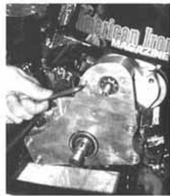
3) Next in is the Tech Cycle chrome Tornado starter motor, which gets attached to the support plate using the two supplied Allen bolts.