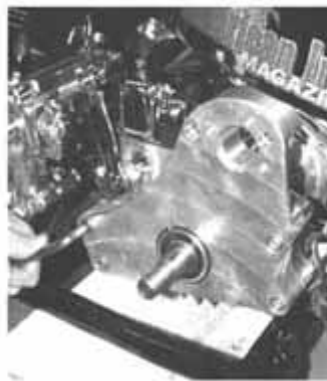
2) The first part on is the Tech Cycle starter motor support plate. Bolt it to the four ears of the tranny, which are for the inner primary cover, using the 5/16" Allen bolts supplied in the kit.